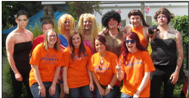
nippers have been part of the community for over 18 years Bed Race 2012

Fund raising for Knaresborough Candlelighters – Childrens Cancer